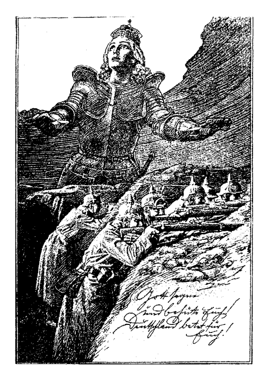
3 Germany's self-image during the war

Germany's own losses of 'blood and treasure'. For France, naturally enough, there could be no peace so long as the German army occupied a fifth of her most productive territory. As for opinion in Britain, peace was unthinkable so long as Germany continued to occupy and behave so outrageously in Belgium, and the million or so men who had voluntarily enlisted on the outbreak of the war had barely begun to fight.