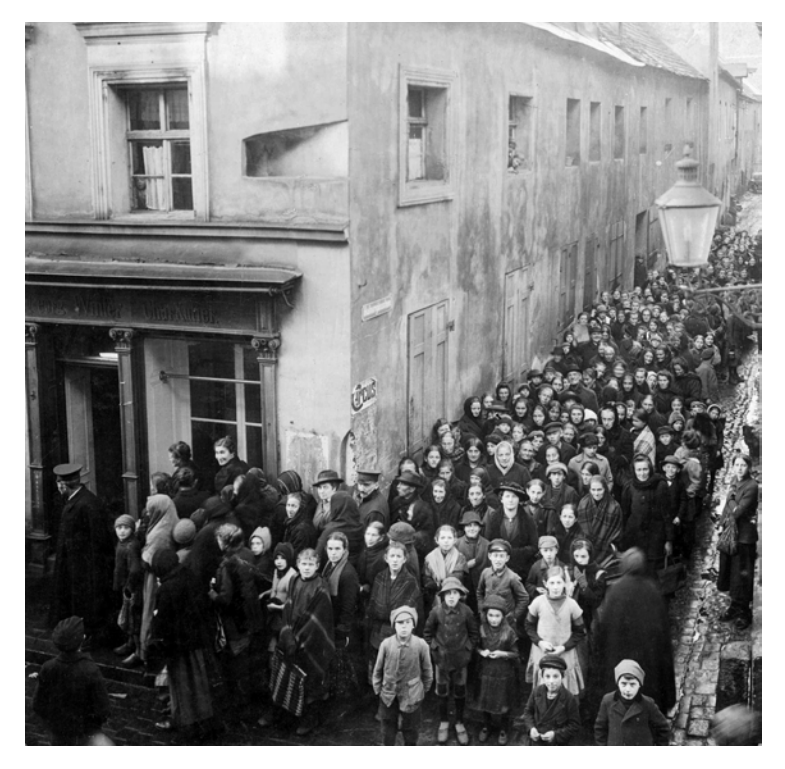
11 The pressure on the civilian population: food queue in Berlin, winter 1917

and Brandenburg. The Russian example was proving seriously infectious, and economic hardship gave edge to the swelling demand for peace.