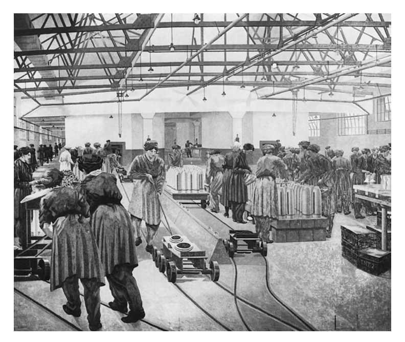
7 Women workers in a munitions factory

their stocks of ammunition, and it was becoming clear that not only men but industry would have to be mobilized for the war effort. In Germany this was done under the auspices of the military, in Britain by the civilians. There the initiative was taken by the most dynamic member of the government, David Lloyd George, who over Kitchener's protests created first a Committee and then in May 1915 a Ministry of Munitions, which combined industry, labour, and civil servants under government control with plenary powers over every aspect of munitions supply. In 1917 further such ministries